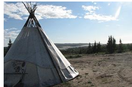
Figure 3. Northern Quebec Cree Project.

As defined in the One with Nature 2 and We Rise Together 3 reports, IPCAs are lands and waters where Indigenous governments have the primary role in protecting and conserving ecosystems through Indigenous laws, governance, and knowledge systems. NCC has specialized skills in conservation management and applies them to achieve community-driven conservation solutions. We are committed to sharing our skills where needed to support Indigenous conservation initiatives and designation of new IPCAs.