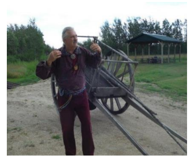
Figure 2. Métis history presentation, Weston Family Tallgrass Prairie Interpretive Centre, Manitoba.