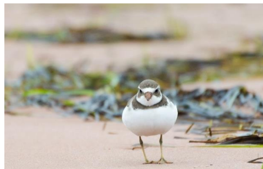
Figure 5. Piping plover at Cascumpec Sandhills, where NCC is collaborating with the Mi’kmaq Confederacy of PEI on shared conservation objectives.