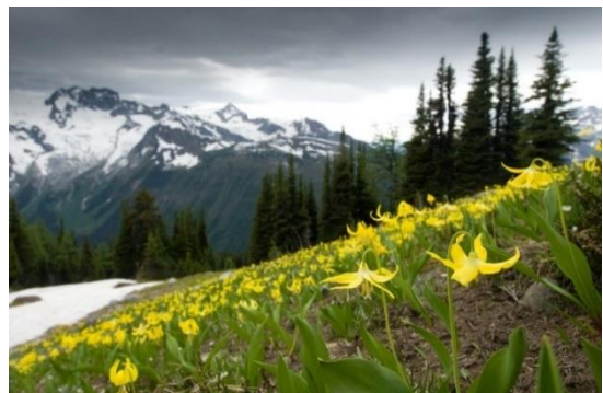
Figure 4. Glacier lilies in the Jumbo Pass.

The second project concluded in January 2020 when NCC joined the Ktunaxa Nation, Province of BC, Government of Canada, and private funding partners to purchase development rights in BC’s Jumbo Valley. This project protected an area known as Qat’muk that is culturally significant and sacred to the Ktunaxa. After 30 years of uncertainty about the future of these traditional lands, the Ktunaxa Nation Council are now able to move forward with community consultation to ensure stewardship and conservation of this area in the Central Purcell Mountains through the creation of an IPCA.